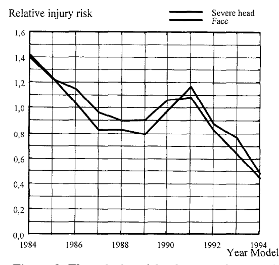
Figure 3. The relative risk of severe skull/brain injuries and facial in car to car collisions with cars of different year model. Facial injuries = 390, skull/brain injuries = 347.

The reduction of minor to moderate head injuries, mainly consisting of commotion, was 76% from year model 1984 to 1995. The major reduction occurred after 1990, where the relative risk fell by approximately 50%.