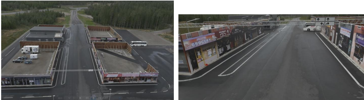
Figure 4. Aerial and entrance view of the city area

The city area is located in the southern part of the facility and is connected to the rural road at two places. It consists of 4 building blocks (40 x 25 x 4 m), but there are plans to supplement it with additional five blocks. The city area will primarily be used to test the vehicle's capacity to interact with the surrounding environment. Test scenarios will include avoidance of collision with buses, cyclists, pedestrians or other road users. Streets have a 2.0% incline for good drainage into sewage drains. There are acceleration roads, longer than 150 m, before the intersection. The main street equipped with "portals" with traffic signs. The area therefore covers a number of different sub-areas, such as a town center with varying street widths and lanes, bus stops, pavements, bike lanes, street lighting and building backdrops. The city area also has a road system with different kinds of test environments such as roundabouts, T-junction, return loop and lab area (100x30 m). One block contains the control room and warehouse for dummies.