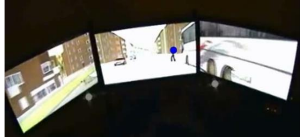
Figure 6. Ambulance drivers have trained at AstaZero both by driving on the track and in a desktop simulator