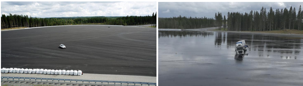
Figure 3. Virtual reality and trailer ESC tests on the high-speed area

A separate control tower is overlooking the area. The tower is two stories high for good visibility, and it provides a platform on the roof for visitors. Remote control of targets, balloon cars and driving robots will be performed from the control tower.