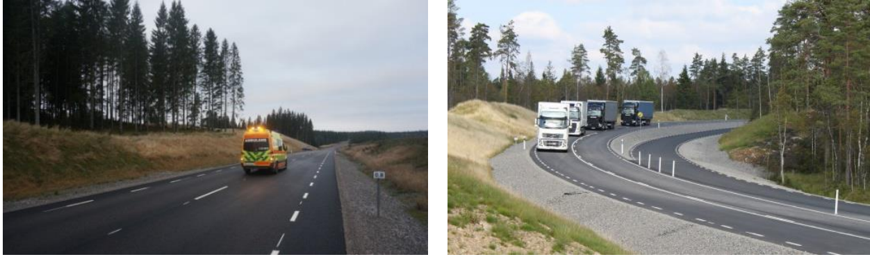
Figure 2. Emergency vehicle driver and platooning research on the rural road