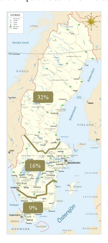
Figure 2. Fatal crash risk increase with non-studded tyres on non-ESC cars compared to studded tyres.

In non-ESC cars the risk reduction of LOC for studded tyres compared to non-studded was 65%. In ESC cars, the risk reduction, compared with non-ESC cars, was 92% including all types of winter tyres. In a similar way as for rear-end crashes, the effect of studded tyres depends on the proportion of traffic on ice and snow, which differs greatly between the different regions in Sweden. With non-ESC cars fitted with non-studded tyres, the risk for a fatal crash during the winter period increases in Southern Sweden by 9% compared to non-ESC cars with studded tyres. In the Middle and Northern part the same risk increase was 16 and 32%, respectively.