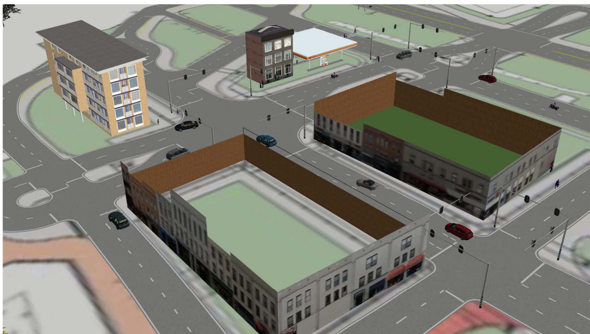
Figure 3. Conceptual model of M City.

Therefore, MTC has designed and constructed a new, one-of-a-kind purpose built test facility for connected + and automated vehicles, named M City. This facility is designed to be a condensed, built to standard, simulation of a US city that will appear as a real environment to AV sensors. It is located directly adjacent to the Pillar 1 Connected Ann Arbor environment. Figure 3 shows the concept model of M City.