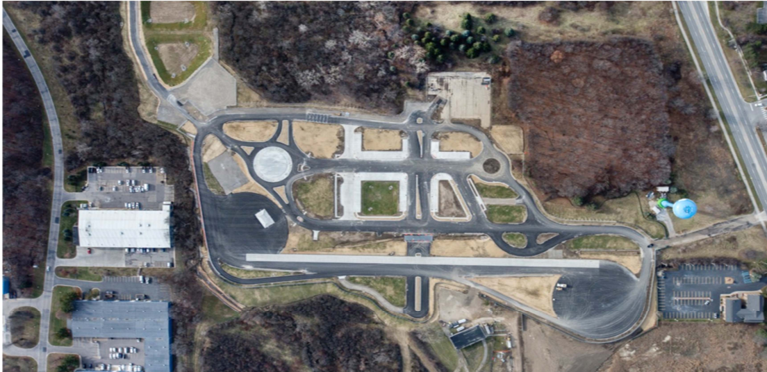
Figure 4. Aerial photograph of M City.

Civil works and construction for this facility were completed in November 2014, with equipage of traffic control devices, lighting, and building facades scheduled at the time of this writing. The facility is expected to be fully operational by July 2015. Figure 4 shows an aerial photograph and layout of M City.