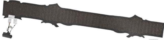
Figure 3. HOD Sensor Mat

centre hub. The system measures the current flowing from the sensing electrode towards vehicle ground, which is proportional to the capacitance. If a driver touches the steering wheel, the capacitance, and with that the current, increases.