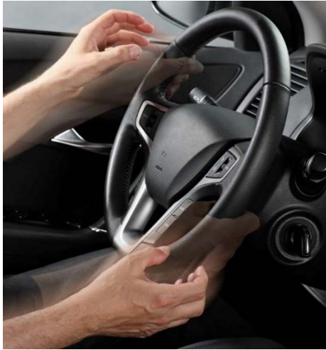
Figure 1. “Hands off” detection scenario

smooth roads, especially at low speeds. IEE developed a capacitive “Hands Off Detection” (HOD) sensor integrated into the steering wheel rim to overcome those concerns. This HOD sensor allows the vehicle to detect precisely if the driver has his hands on the steering wheel, and if he does not, to initiate an appropriate warning cascade. The IEE HOD sensor has been in production since the end of 2013.