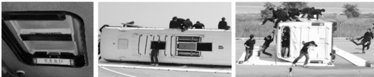
Figure 2. Escape simulation through emergency exits of large bus

In 2016 the door of a chartered bus caught fire and stuck at an accident on the express way. This accident resulted in 10 deaths. The existing regulation on the emergency exit in the bus requires one or more emergency exit. The windows are an alternative to the emergency exit. However, this requirement is not adequate and poses a high risk in fire or under water. In 2016 the amendment was promulgated to require one or more emergency exit (at least one emergency exit for buses with 30 or less passengers, more than one emergency exit for buses with 31 or more passengers) and emergency escape devices from 3 to 11 according to the number of passengers in January, 2017 to strengthen the safety of bus passengers. This requirement will be effective for new buses with 16 or more passengers in 2019.