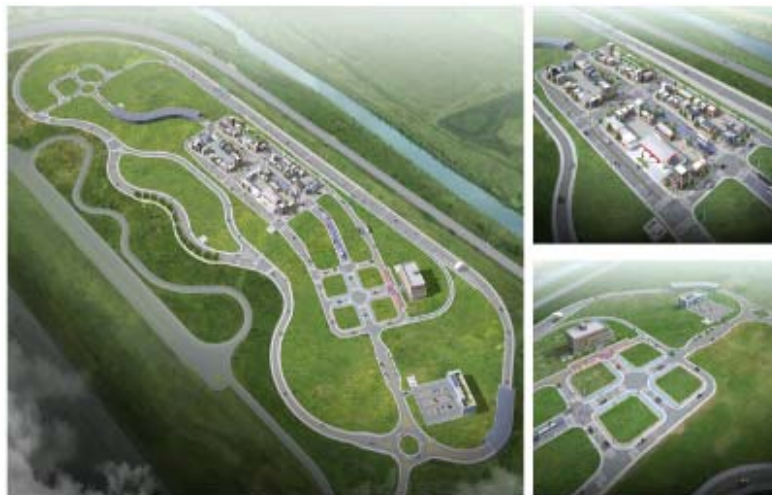
Figure 3. Test bed (K-City) for autonomous vehicles

Construction of test bed (K-city) for autonomous vehicle In the TS/KATRI proving ground (364,000 square meters) a experimental city integrated with communication system is being constructed for testing autonomous vehicles. The world-class experimental city suitable for testing autonomous vehicles is under construction to secure the assessment procedures of three core safety fields, such as operation and failures, cyber security and driver's taking back control, of autonomous vehicles. By October 2017 a motorway system dedicated for vehicles will be completed. By December 2018 the rest of roads (downtown, rural roads and community roads) will be completed.