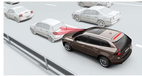
Figure 1. City Safety – a low speed auto brake system

City Safety is a low speed collision avoidance and mitigation system with the aim to mitigate and in certain situations avoid rear-end collisions. The scope for the system is to assist in every day scenarios like cues, entering roundabouts or parking situations, scenarios that may end up in collisions due to drivers being distracted or inattentive, Figure 1.