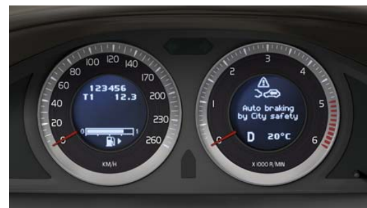
Figure 2. City Safety activation message

Once the system has activated, the driver is given a message as shown in Figure 2. There is no warning given. To help prevent drivers from adapting their normal driving to the system it is deliberately designed to give a harsh/unpleasant braking sensation, with brake activation that is intentionally set late to be outside the drivers comfort zone.