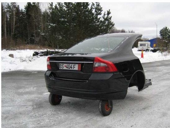
Figure 6. Target vehicle represented by a half real vehicle body.