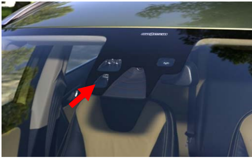
Figure 3. Placement of City Safety laser sensor behind the windshield.

The sensor utilizes 905 nm laser light. It has multiple IR laser channels to detect at which lateral position in front of the vehicle a potential target vehicle is placed. The transmitted laser light is reflected by the reflective surfaces of the target and the sensor uses the time of flight principle to calculate the distance to potential targets. In other words, the time from transmission to reception determines the distance to the potential targets. Relative velocity and acceleration is derived from multiple distance measurements. Vehicles within 10 m in front of the sensor are detected.