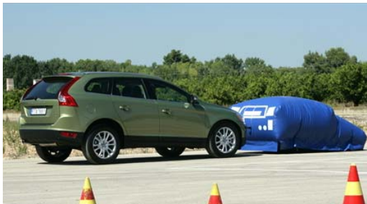
Figure 5. Target vehicle represented by an inflated balloon car.

Special test equipment was developed and used for the different test purposes. Target vehicles were represented by large inflated balloon cars (Figure 5) and modified vehicles (Figure 6) that allow for possible collisions with the host vehicle. The balloon car can also be attached to a horizontal beam connected to a vehicle such that it also can represent a moving target in different scenarios.